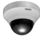
VCC-9685VP 1/4" Colour CCD Indoor Mini Dome Camera